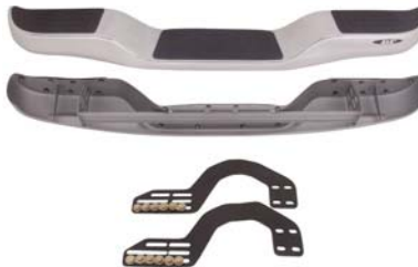
Toyota Bar Assembly Rear (Chrome) 2WD HILUX 97-01 TN51535NAC

Are also Suitable for the following models: