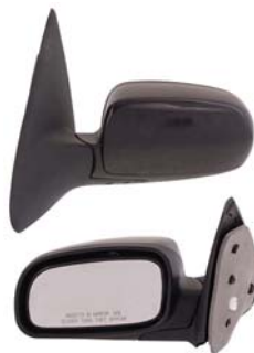
Ford Falcon AU 07/98-0N Door Mirror can also be used for Ford Falcon BA Mirror FEU5000NTL/R

NTS1535NAC Mitsubishi TRITON 96-0N TN31535NAC Toyota Hilux 2WD 88-91 TN41535NAC Toyota Hilux 2WD 91-97 TNA1535NAC Toyota Hilux 4WD 88-91 TNB1535NAC Toyota Hilux 4WD 91-97 TNC1535NAC Toyota Hilux 4WD 97-01