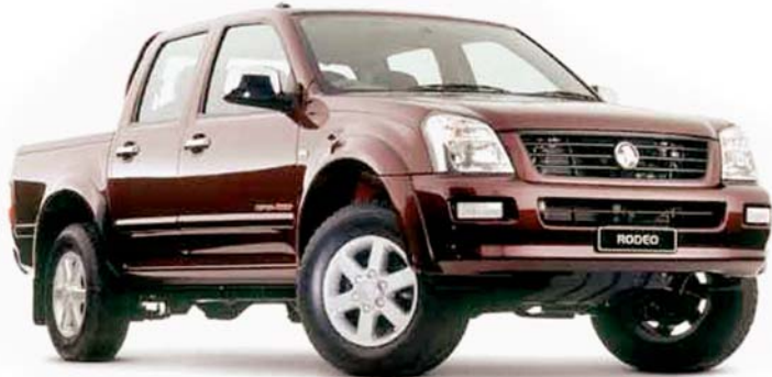
IRA - Holden Rodeo RA 01/03 - ON